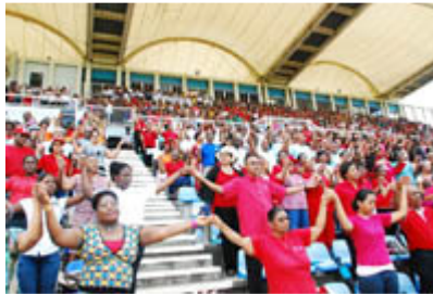
Some of the Faithful at Ato Boldon Stadium, Couva

The Catholic Church in Trinidad and Tobago celebrated the 50th anniversary of the nation at the Ato Boldon Stadium in Couva on August 19.