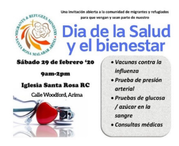
Flyer for Arima's Health and Well-being Fair

The Arima Parish hosted a Health and Well-being Fair on February 29, 2020 for members of the migrant and host communities in their area.