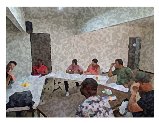
Adolescent Language Classes – Arima

The parishes that offer language learning programmes have been very intentional in involving migrants themselves in the work of the ministries.