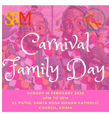
The recently concluded Carnival Season saw the participation of Migrants in the national carnival celebrations. Some Parishes, such as Arima, hosted a Carnival Family Day.

CCSJ & AMMR - PLANS FOR 2ND QUARTER 2020