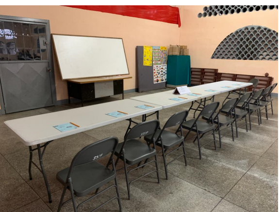
Mayaro Parish Child Friendly Space

The Arima Parish hosted a Health and Well-being Fair on February 29, 2020 for members of the migrant and host communities in their area.