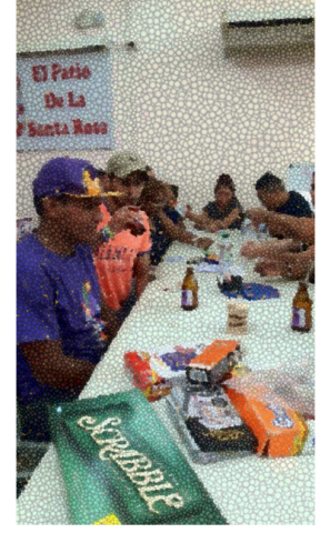
Games/movies night -