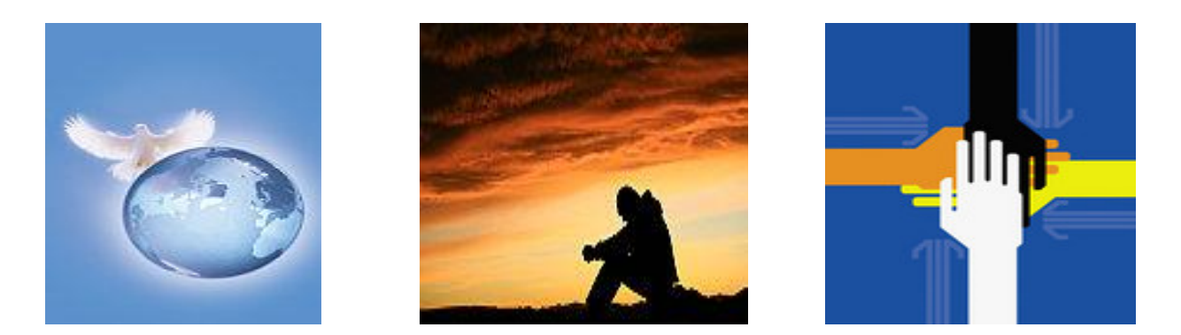
The 1971 document is a reflection on "the mission of the People of God to further justice in the world." Like the Bishops, we should read the signs of the times and embrace the See, Judge, Act methodology.

involved." Please read and note the important insights in Justice in the World. This will inform the conversation in our Archdiocese about our 2<sup>nd</sup> Pastoral Priority: Revitalizing Catholic Culture and Identity . Our faith in Jesus must inspire us to do more for justice and peace.